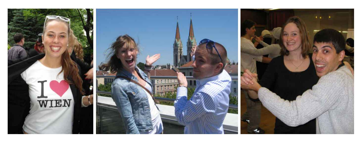
CIEM – CENTRE FOR INTERNATIONAL EDUCATION & MOBILITY

The ESN team will help you whenever there is a problem with your buddy!