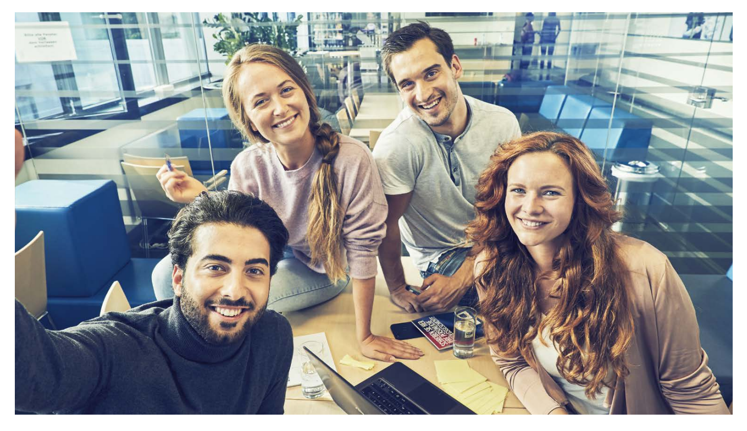
CIEM – CENTRE FOR INTERNATIONAL EDUCATION & MOBILITY

FHWien der WKW CIEM – Center for International Education & Mobility Währinger Gürtel 97 1180 Wien, Austria