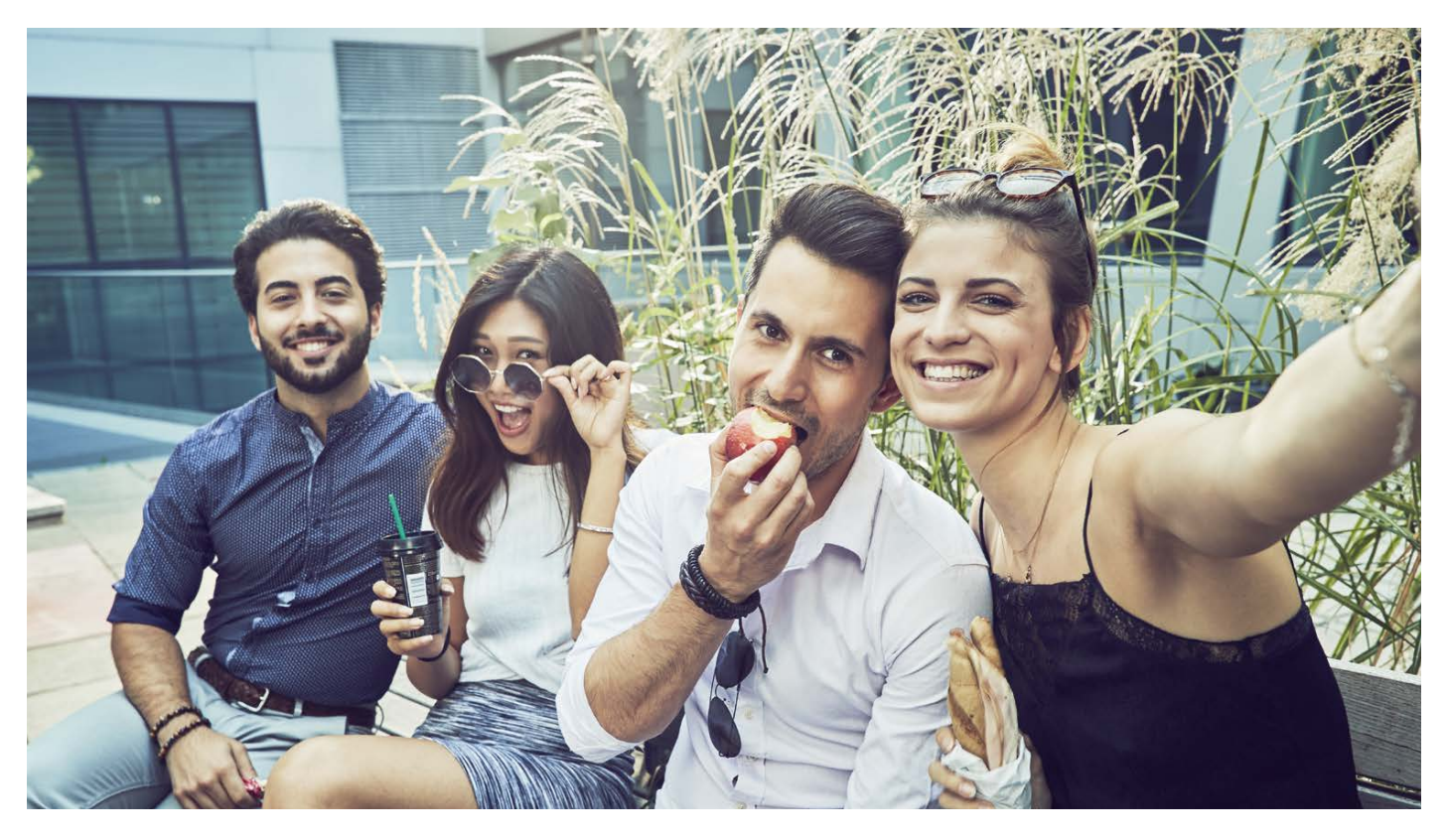
CIEM - CENTRE FOR INTERNATIONAL EDUCATION & MOBILITY

Please check our online Incoming Fact Sheet for the exact semester dates.