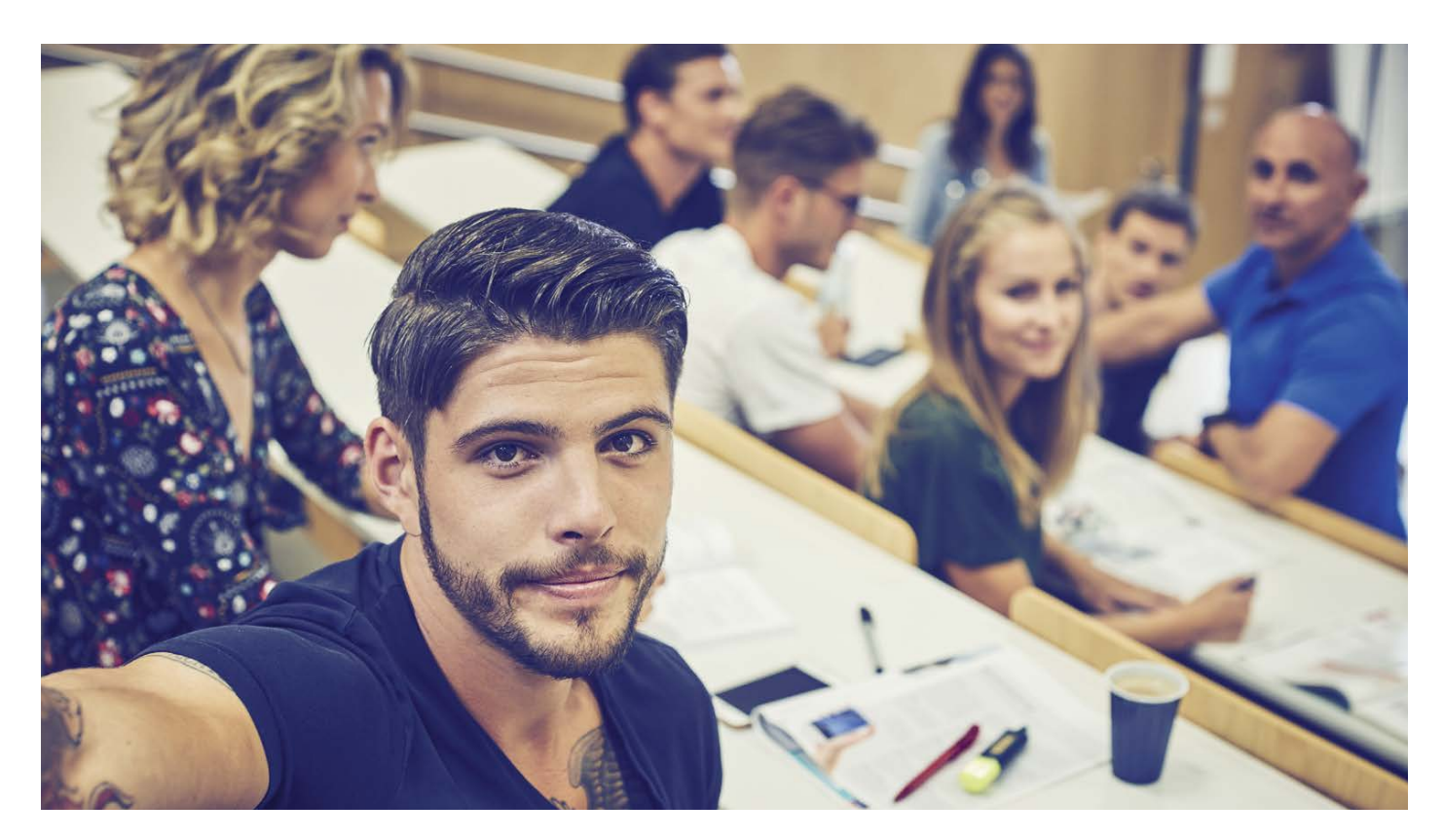
CIEM – CENTRE FOR INTERNATIONAL EDUCATION & MOBILITY